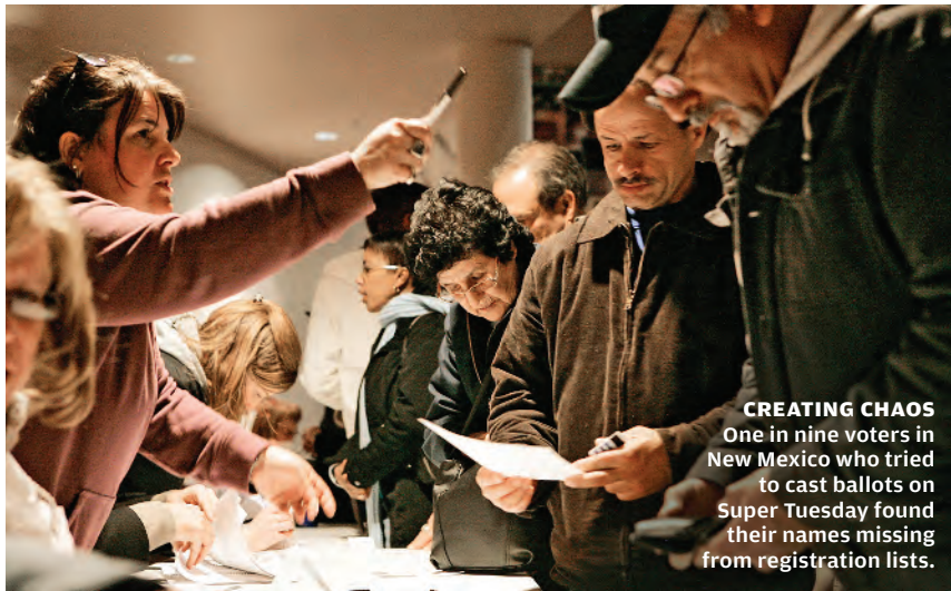
CREATING CHAOS One in nine voters in New Mexico who tried to cast ballots on Super Tuesday found their names missing from registration lists.

JAKE SCHUELLKOPF/AP IMAGES (VOTERS); PAUL J. RICHARDS/NEWS.COM (MCCAIN); ISTOCK ("WILL WORK FOR FOOD" SIGN, GOLFER, CHILD WITH BOW AND ARROW); FRANK WHITNEY/GETTY IMAGES (OLD CAR); TONY GUTIERREZ/AP IMAGES (OIL PLATFORM); TERRY SCHMITT/NEWS.COM (ROBERTS)